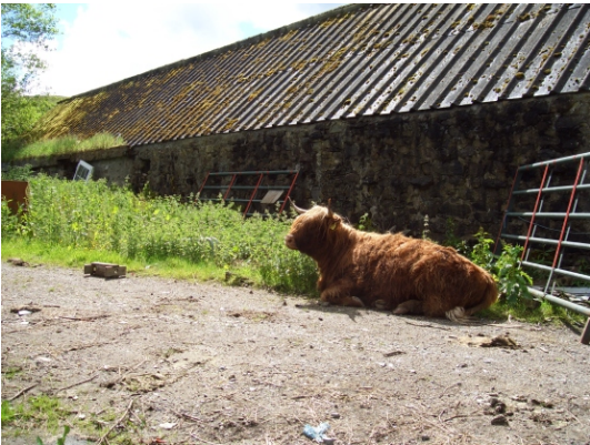
Glengoulandie, rather run down in 2007

A wide landscape view of a valley. In the foreground, there are green fields with some farm buildings and trees. In the background, a large hill rises, covered in green vegetation and some trees. The sky is overcast with grey clouds.