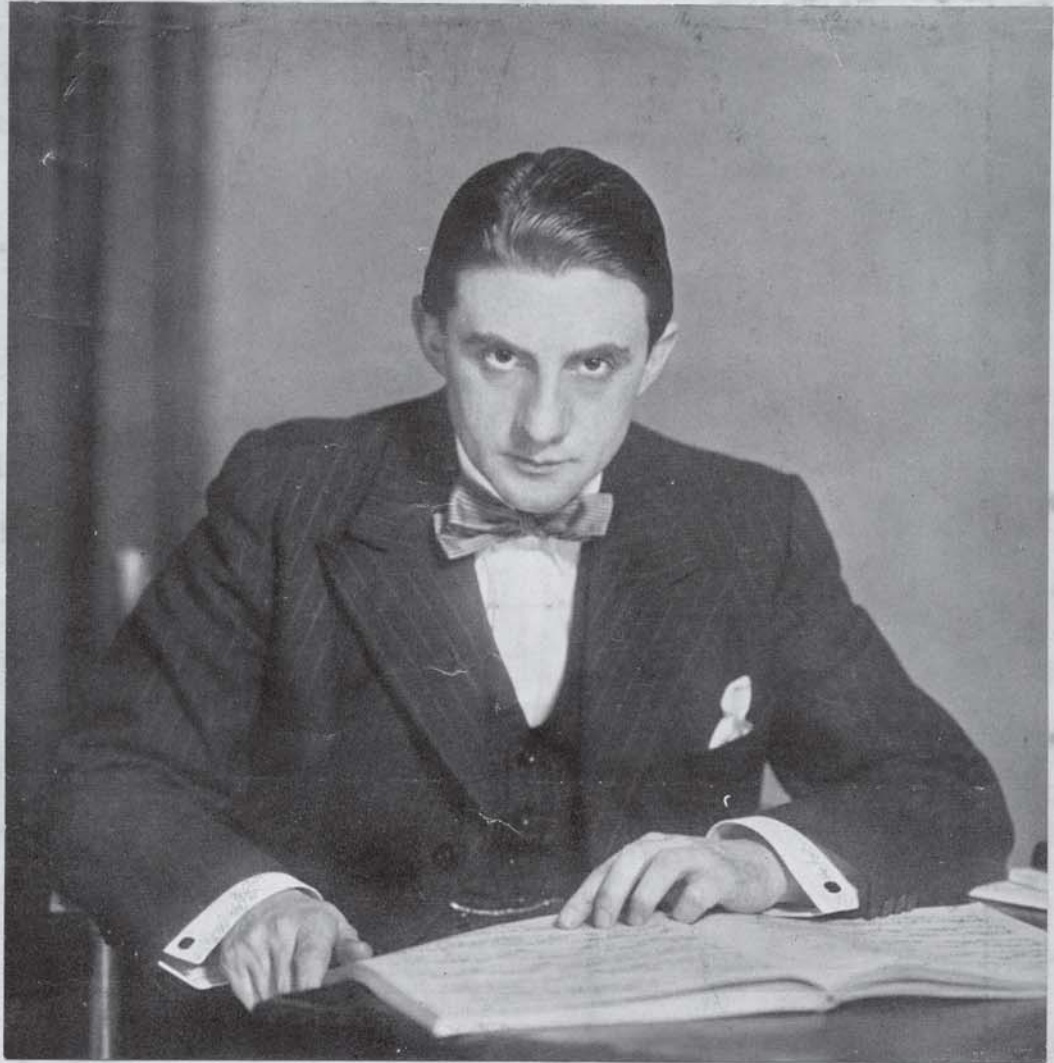
JOHN BARBIROLI, F.R.A.M.